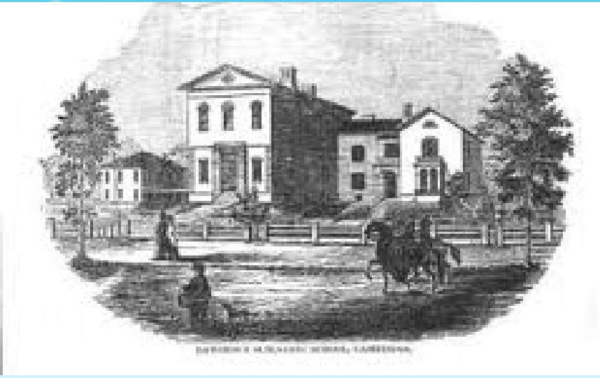
School in the South, 3 years after the Civil War